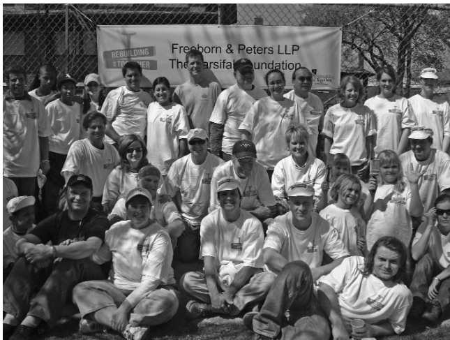
Our Rebuilding Together * Metro Chicago team

On Saturday, April 28, Rebuilding Together * Metro Chicago arrived at PACTT Learning Center, 7101 N. Greenview, with a team of more than 50 volunteers to stage a one-day major rehab and landscaping makeover for the school and the grounds of PACTT's new adult group home next door. Bringing professional electricians, carpenters, landscapers, painters and many hardworking volunteers, the Rebuilding Together crew hit the ground running early that day and worked until the job was done.