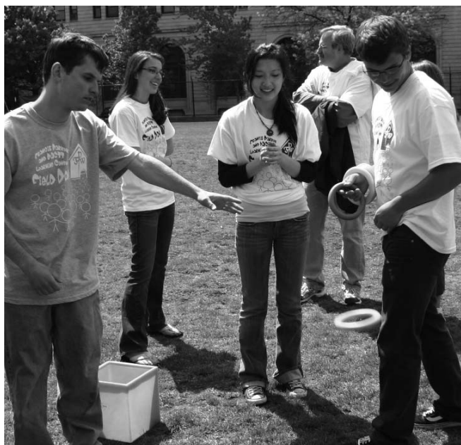
Enjoying a game of ring toss at Field Day

With hands-on assistance and plenty of cheering from the Parker juniors, PACTT student athletes competed for medals in events ranging from sprints to basketball free throws and soccer goal kicks to bean bag tosses and a three-legged race. This is the second year Francis Parker students have helped stage PACTT Field Day, and the first time they have hosted the event at their school. Thanks to our Francis Parker friends!