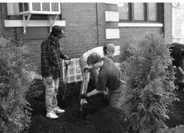
Planting new bushes and flowers

PACTT Learning Center was one of 78 Chicago homes and nonprofits selected by Rebuilding Together * Metro Chicago to receive major renovations on National Rebuilding Day, Saturday, April 28, 2007. For this all-out one-day effort, Rebuilding Together * Metro Chicago annually rallies over 3,500 volunteers from more than 100 corporations, skilled labor unions and service organizations.